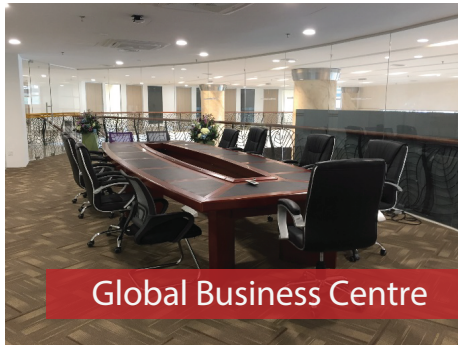
Global Business Centre